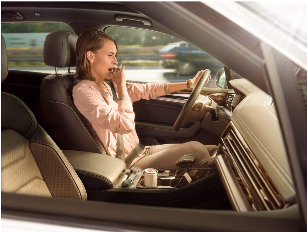
Figure 1. Driver's Drowsiness

Face recognition is finding many uses such as security purpose, automatic attendance system among others. One of the main causes of road accidents is to suffer from the problem of drivers' drowsiness which occurs after a long drive and not taking enough rest before destination. An alert system can be designed and developed which can alert a driver well ahead of time before an accident takes place. Although there are many techniques to detect drivers' drowsiness, we propose a system which collects real time data and uses a deep learning approach to predict in advance about the accident.